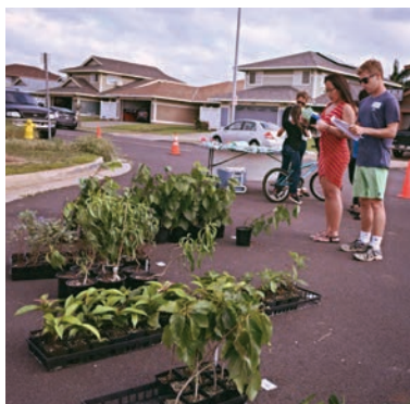
Left: Kaneohe Outdoor Circle's Wa'a Garden Project