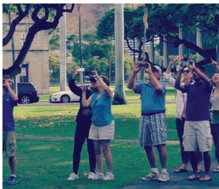
Volunteers learn how to use their phones to measure tree height at Iolani Palace.

The Exceptional Tree Map is nearly complete, and the final pieces of data are expected to be inputted this fall. TOC plans to take the map to communities as a valuable environmental learning tool.