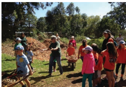
Right: TOC staff and volunteers give out 300 plants to Kapolei Hawaiian Homestead residents