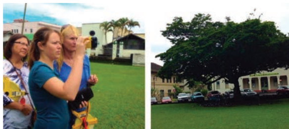
Interns and volunteers map Exceptional Trees along Ali'i Drive and at Kalakaua Park in Hilo